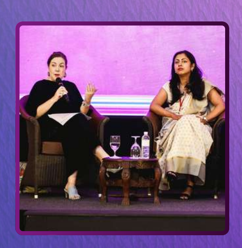
Policy Brief Session