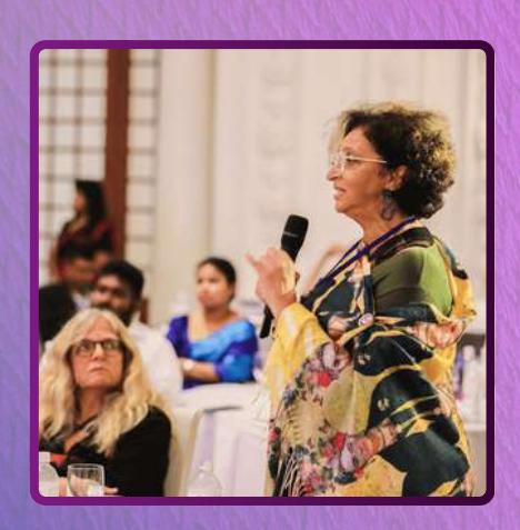
Rapid Fire Session